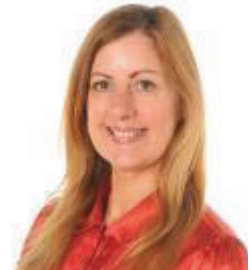
Head of Modern Foreign Languages

Have a lovely summer! À bientôt! ¡Hasta pronto!