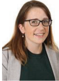
Head of Science

include greetings, numbers, months, days and birthdays.